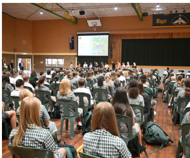
Welcome Year 7's