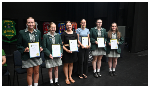
Our 2023 VCE High Achievers... Congratulations!