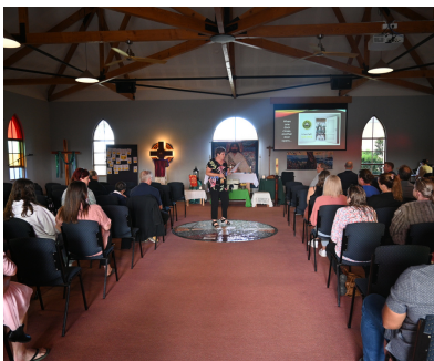
Charism & Coffee