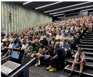
Year 7 Parent Information Evening