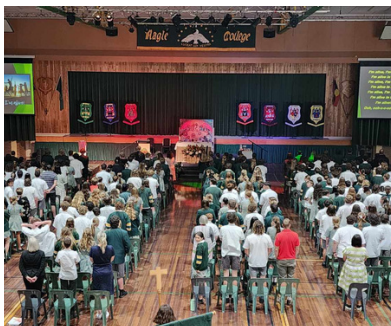
Whole School Commencement Mass